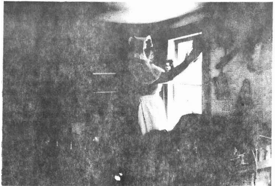
Costumed staff member in workroom of house in restored village on Long Island.

financial position. It had no bonded indebtedness. After World War II, the population tripled from 400,000 to about one-and-a-half million and Grumman Aircraft had its headquarters there.