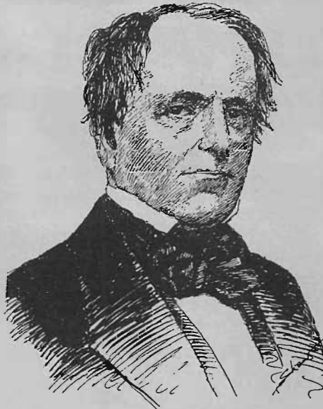
LEMUEL SHATTUCK, IN HIS LATER YEARS

The method, named after John Lancaster who founded the system about 1800 in England, "was popular in this country because it was a quick and inexpensive way to train