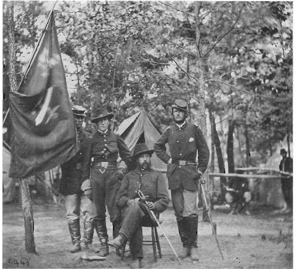
First Michigan Infantry members. 1861-1865

In order to survive, trolleys had to offer something special. A rapid and easy way to get to town was very appealing. (Continued on page 3)