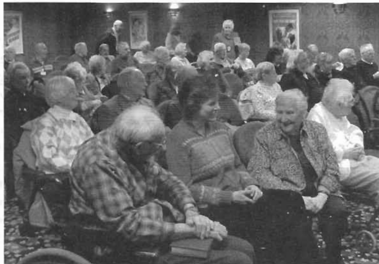
The room began to fill as friends and attendees greeted each other

Another involved the freight car service that the interurbans ran at night, after passenger service ended for the day. On August 5, 1927, two sets of two cars were pulled uphill on Huron. As the cars were being recoupled, they slipped loose and began rolling